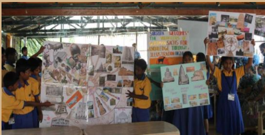
Illustration through knowledge

15 th August, as it's celebrated across the length and breath of the nation commemorating the day of Independence – it is always very encouraging to see the young students of SUKRUPA give their heart & soul in preparing for the day. The weeks prior to the Independence Day, 'SUKRUPA Education Centre' was buzzing with activities. Children were seen practicing dance, perfecting their speecehes and the recitals under the guidance of the teachers who took the initiative to hone their skills and oversee and ensure that the day was celebrated with great gaiety. This 67 th Independence Day was especially a joyous day for SUKRUPA as we celebrated with our new team of teachers. Most importantly, under the aegis of Kanthula foundation, 4 of our children received Kanthula Award for their good academic results on the day – a motivation for the children to reach their goal and hope to see many more children become successful.