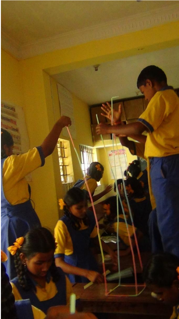
Children in the middle of the session

Volunteers are an integral part of SUKRUPA Education Centre. Their time & effort has always proven to be a channel through which our children realise and learn about facts of life outside their slum community. Most importantly, volunteers have also stepped in as an extra pair of hands for the teachers, in imparting skills and creating awareness on various child related issues. This time we had volunteers from Target (they are one of the corporates who is supporting SUKRUPA through Smile Foundation) to take this forward. It was very encouraging to see the ceaseless effort of the volunteers to plan out activities on life skills and general knowledge for our high school children. It was a fruitful day for the children especially, for the girls who were sensitised on hygiene and reproductive health.